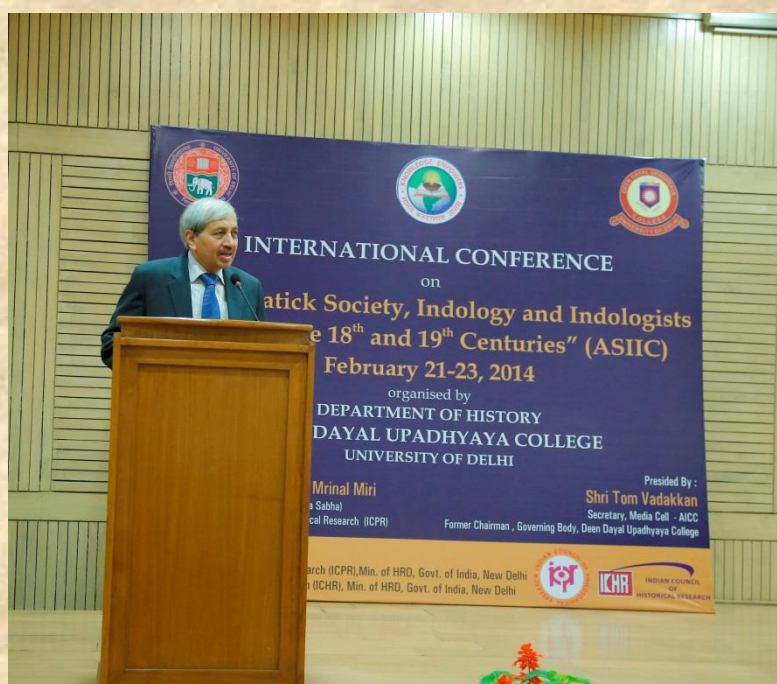
Delegate speech during the Conference

The present day educational, scientific and culturally developed status of India owes a great deal to the beginning of the Indian Renaissance during the late 18 th -19 th centuries which was, to a great extent, made possible by the establishment of the Asiatic Society in 1784, at Calcutta by Sir William Jones, a great scholar of languages and a jurist of eminence. Incidentally, in January 2014, the Asiatic Society of Kolkata completed its 230 th year. This conference was organised at this momentous juncture and witnessed the attendance of over 150 people and delegates who studied the multi-dimensional roles of academic societies in the light of new research and studies.