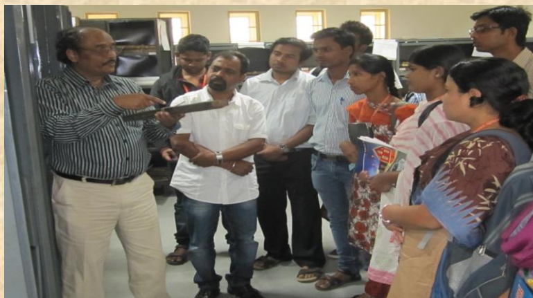
Post Graduate Students, Department of History, Ravenshaw University during the visit to Record centre, Bhubaneswar.